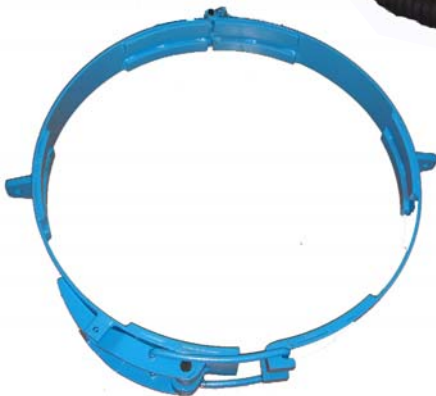
Optional Drum Clamp/Lifting Kit