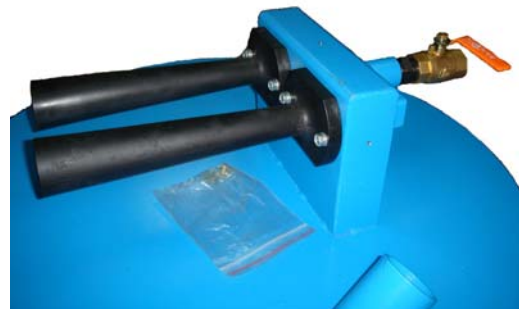
Double Venturi Vacuum Producer

Blast Pots & Cabinets - Control Valves - Abrasive Control Valves - Blast Nozzles - Nozzle Holders & Couplings - Helmets & Breathing Air Filters